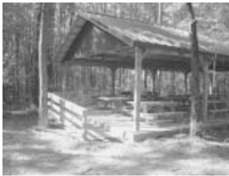
New picnic shelter

Friends and supporters of Congaree Swamp met for their annual meeting on November 19, 2003 at Wavering Place. They were given an update on Sen. Ernest Hollings bill, S.1313 and Representative James Clyburn's companion